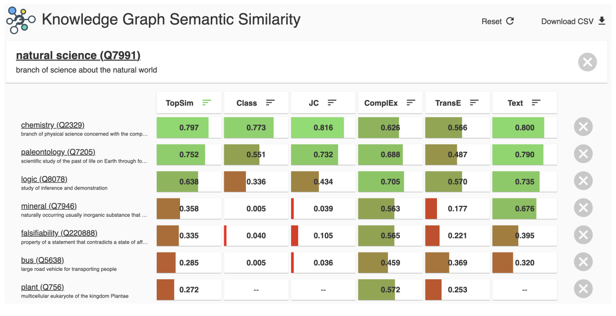
Fig. 1. Example of similarity judgments between natural science and seven other concepts in Wikidata.

embedding models has been created to solve the task of link prediction and node classification. Notable early examples are TransE [9] and ComplEx [10], which organize nodes in a geometric space according to their structural links to other nodes. Random walk methods, such as node2vec variants [11, 12], leverage the generalizability of language modeling by applying it to graph nodes instead of words. More recently, inspired by the success of contextualized language models such as BERT [13], methods that combine structure and semantics have been devised for these tasks. Recent work, however, has signaled a lack of generalizability and robustness of these methods [14, 15], which further motivates the need to understand the underlying similarity reflected by knowledge graph embedding models.